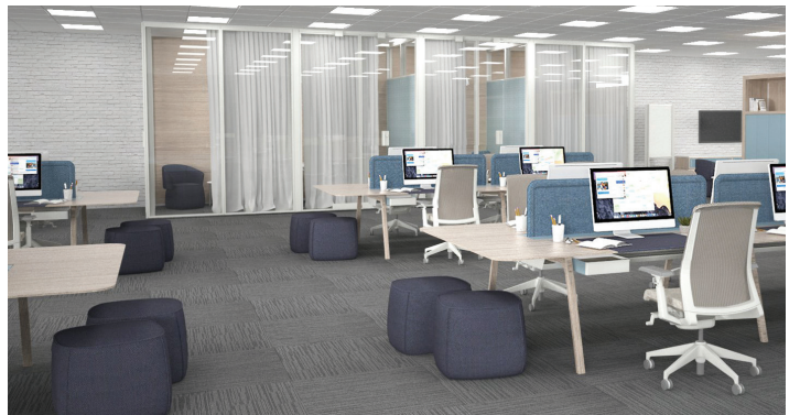
Belonging | Soft Seating at End of Workstations

When people are engaged in their work, they are actively involved and believe their work is meaningful. Although evidence of workstation occupancy failed to influence perceptions of engagement, a warm, natural color palette increased engagement perceptions. Tentative implication(s) also included that activity zones may be uniformly positive, and warm, natural colors are preferred under these conditions.