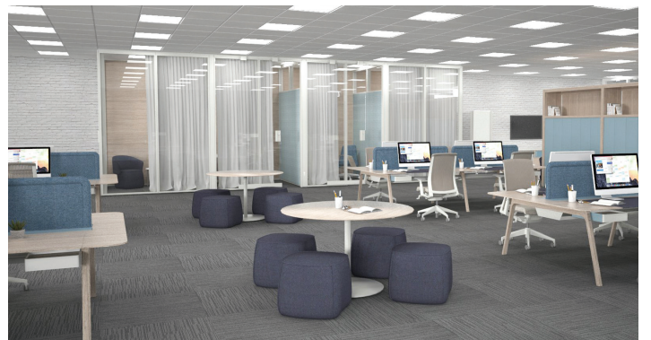
Engaged | Activity Zones

Energized people are enthusiastic and emit vitality. It was evident in this study that layout variety and activity zones impacted perceptions of energy; in contrast, color palette did not reach significance. Evidence of occupied workspace was also tested; however, the results did not determine either significance or insignificance. Tentative implication(s) are that clean-desk policies will need further testing for emotive impact. Enabling interaction may increase such energy perceptions. Additionally, layout variety can increase perceptions of inspiration, calm, autonomy, and energy—a nice (if confusing) outcome.