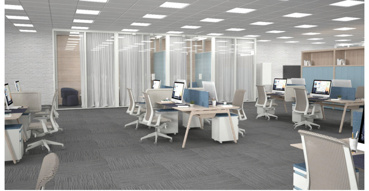
Calm | Low Density

A sense of belonging and feeling welcome is important to many people. To determine how a space affected belonging, perceptual responses to the presentation of three images were compared: 1) screen 18 inches above the desk; 2) screen and storage unit; 3) 48-inch panel. The influence of these divider styles on perceptions of belonging did not reach significance, yet interactive, soft seating at the end of open-plan workstations and a warm, natural color palette did. Tentative implication(s) are that workstation division may not influence feelings of belonging, but inclusive/interactive features and warm, natural colors can.