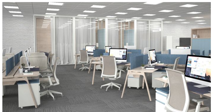
Autonomy | Variation

The images were used in the study demonstrating the variable change that positively impact the emotive principle listed with the image.